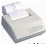
Heavy duty printer