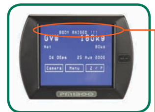
Body Raised Indicator